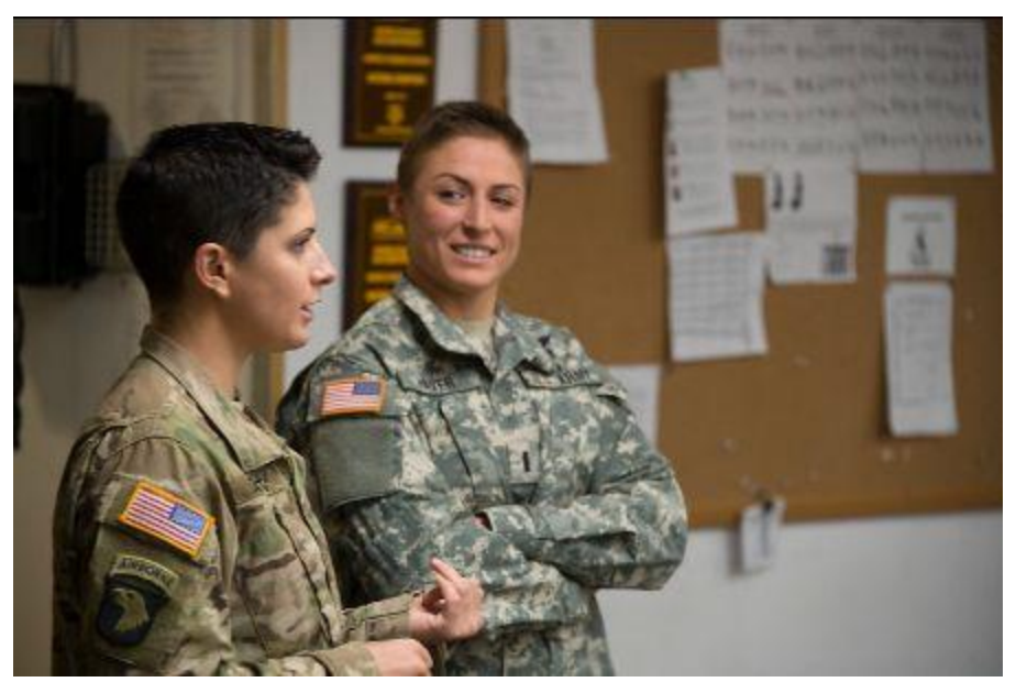
U.S Army's First Female Rangers

WASHINGTON (Army News Service, Aug. 24, 2015)